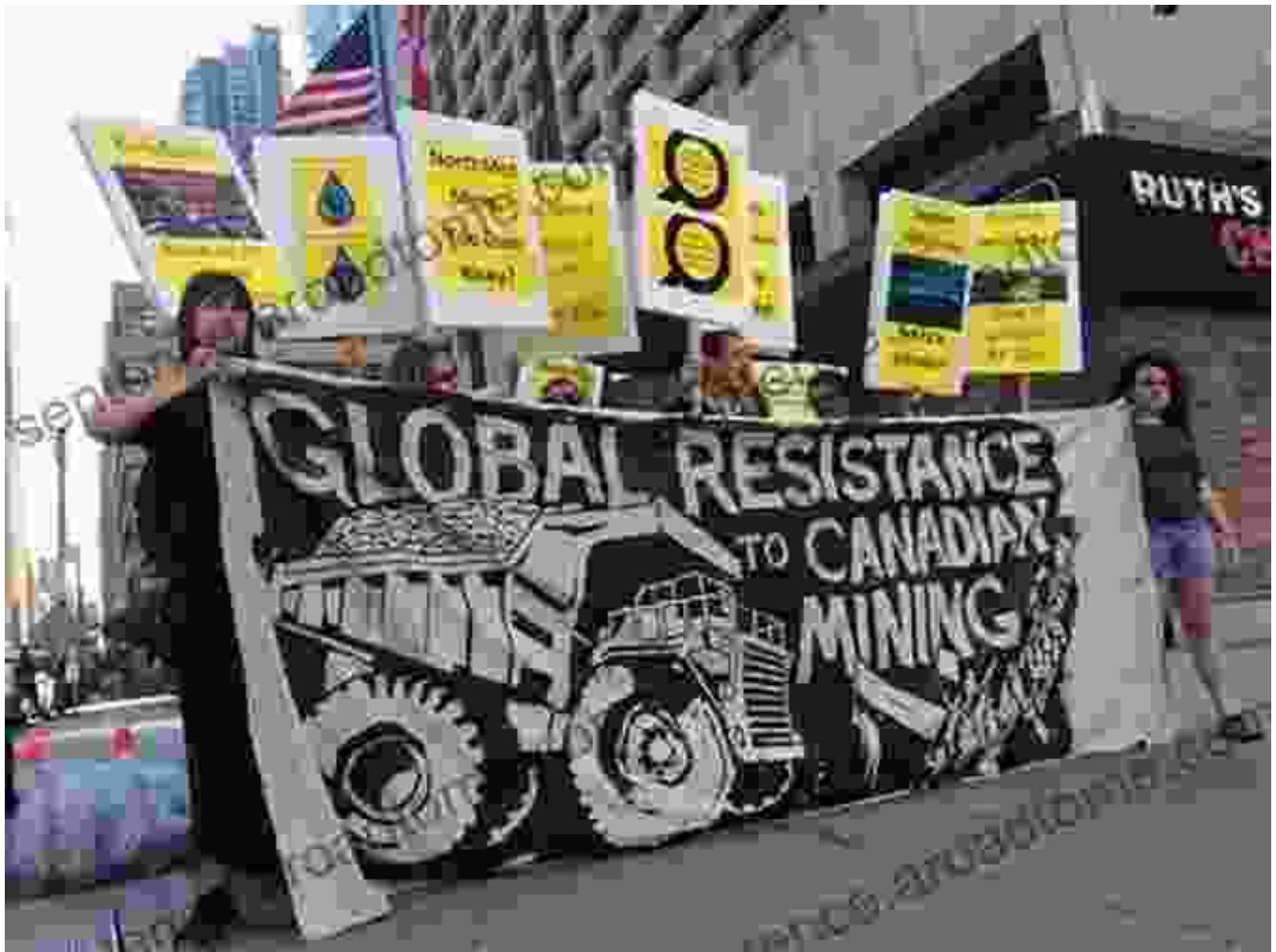
Local residents protest the Polymet project