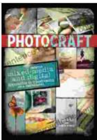
Photo Craft: Creative Mixed Media and Digital Approaches to Transforming Your Photographs