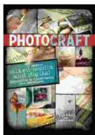
Photo Craft: Creative Mixed Media and Digital Approaches to Transforming Your Photographs

Through its insightful pages, you'll discover an array of innovative techniques that seamlessly fuse the tangible and digital worlds. Learn how to harness the tactile beauty of paints, inks, and collage materials, while simultaneously leveraging the versatility of digital tools like Photoshop and Procreate. This harmonious blend allows you to transform your photographs into captivating works of art, imbued with depth, texture, and a unique artistic flair.