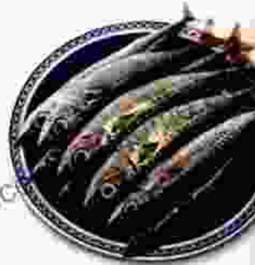
as sardinhas sardines