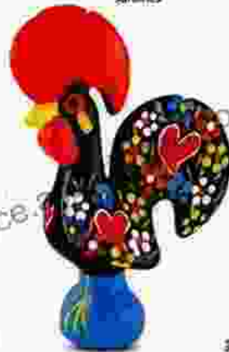
o galo cockatoo