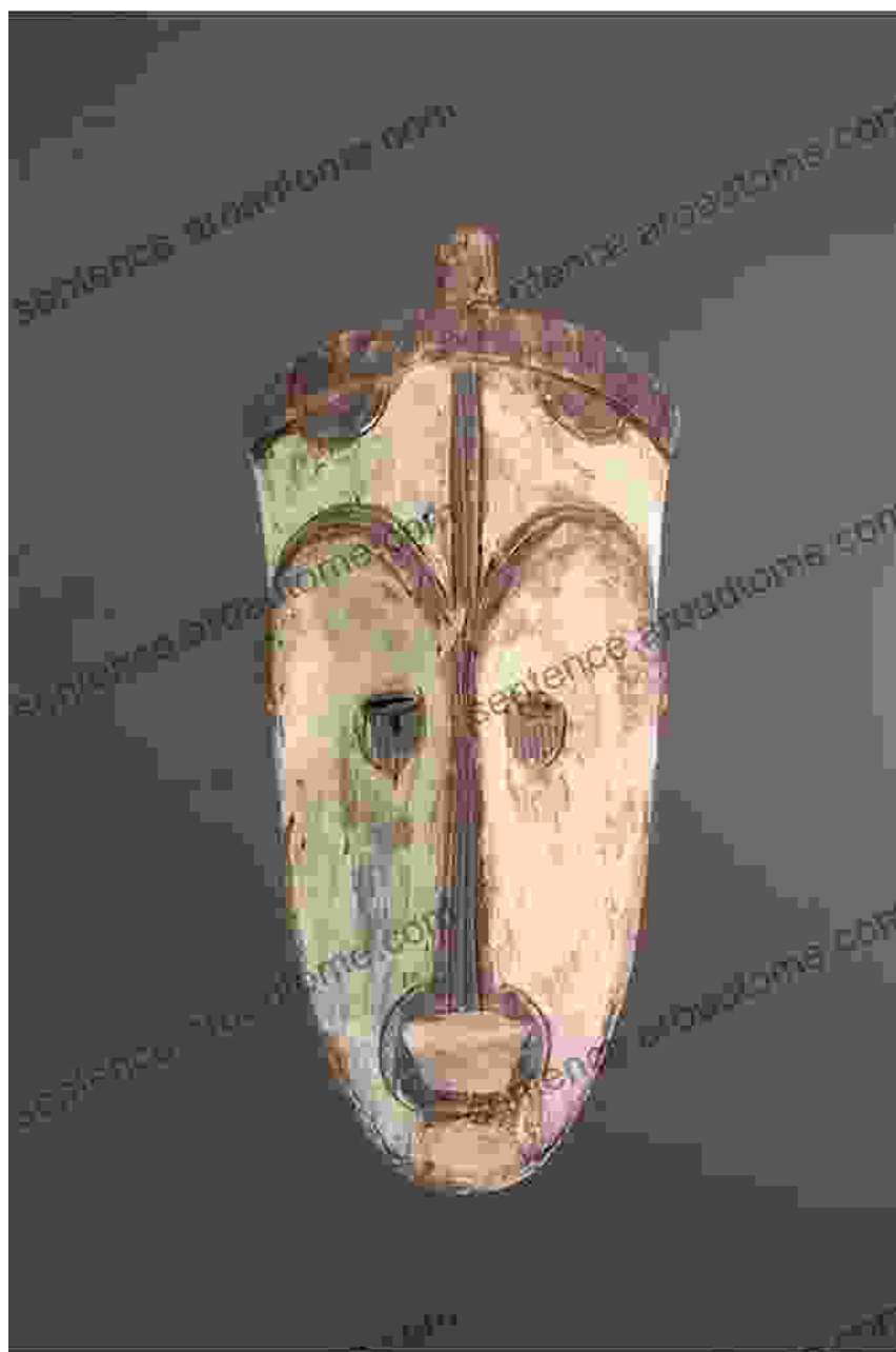
Kota Reliquary Figures: Guardians of Ancestral Memory

The Fang masks, renowned for their expressive faces and intricate designs, are a testament to the artistic virtuosity of Gabonese craftsmen. These masterpieces adorned with geometric patterns and animal motifs played a crucial role in traditional ceremonies, embodying the spirits of ancestors and mediating between the living and the spiritual realm.