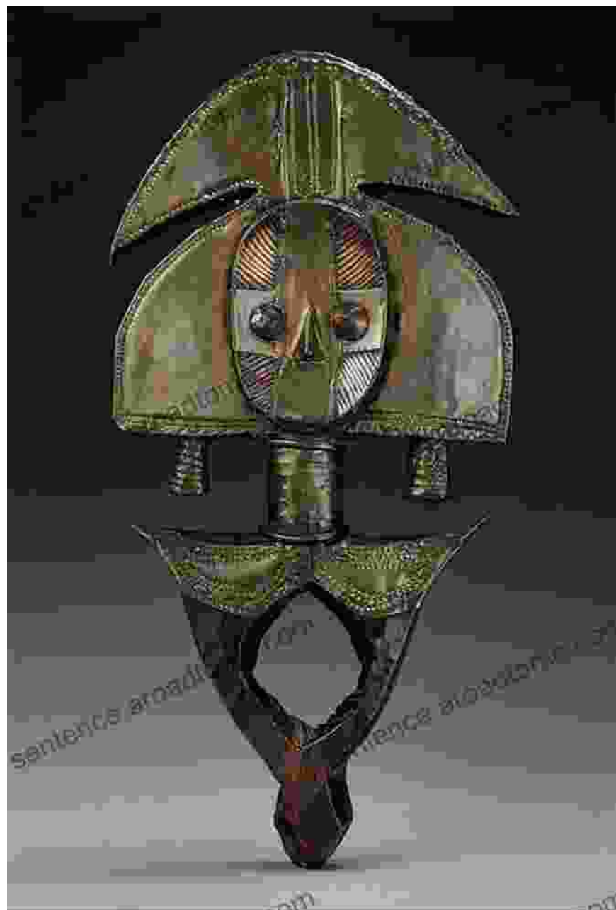
Kota reliquary figure, Gabon

Kota reliquary figures, with their elongated heads and elaborate metal adornments, served as guardians of ancestral spirits. These sacred objects housed the remains of the deceased, providing a tangible connection between the living and their departed loved ones. The intricate carvings and symbolic motifs on these figures represent a rich vocabulary of cultural beliefs and lineage.