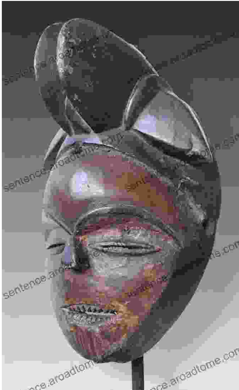
Tsogo mask, Gabon

Tsogo masks, known for their elaborate headdresses and intricate carvings, celebrated cultural identity and served multiple purposes. Worn during festivals and ceremonies, these masks represented different characters or spirits, adding color and vibrancy to communal gatherings.