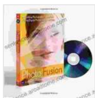
Photo Fusion: A Wedding Photographers Guide to Mixing Digital Photography and Video by Jennifer Bebb

As a wedding photographer, you know that capturing the perfect moments of your clients' special day is paramount. In today's digital age, couples are increasingly opting to have both photographs and videos of their wedding, providing them with a comprehensive and lasting record of their celebration.