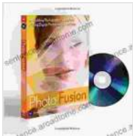
Photo Fusion: A Wedding Photographers Guide to Mixing Digital Photography and Video by Jennifer Bebb