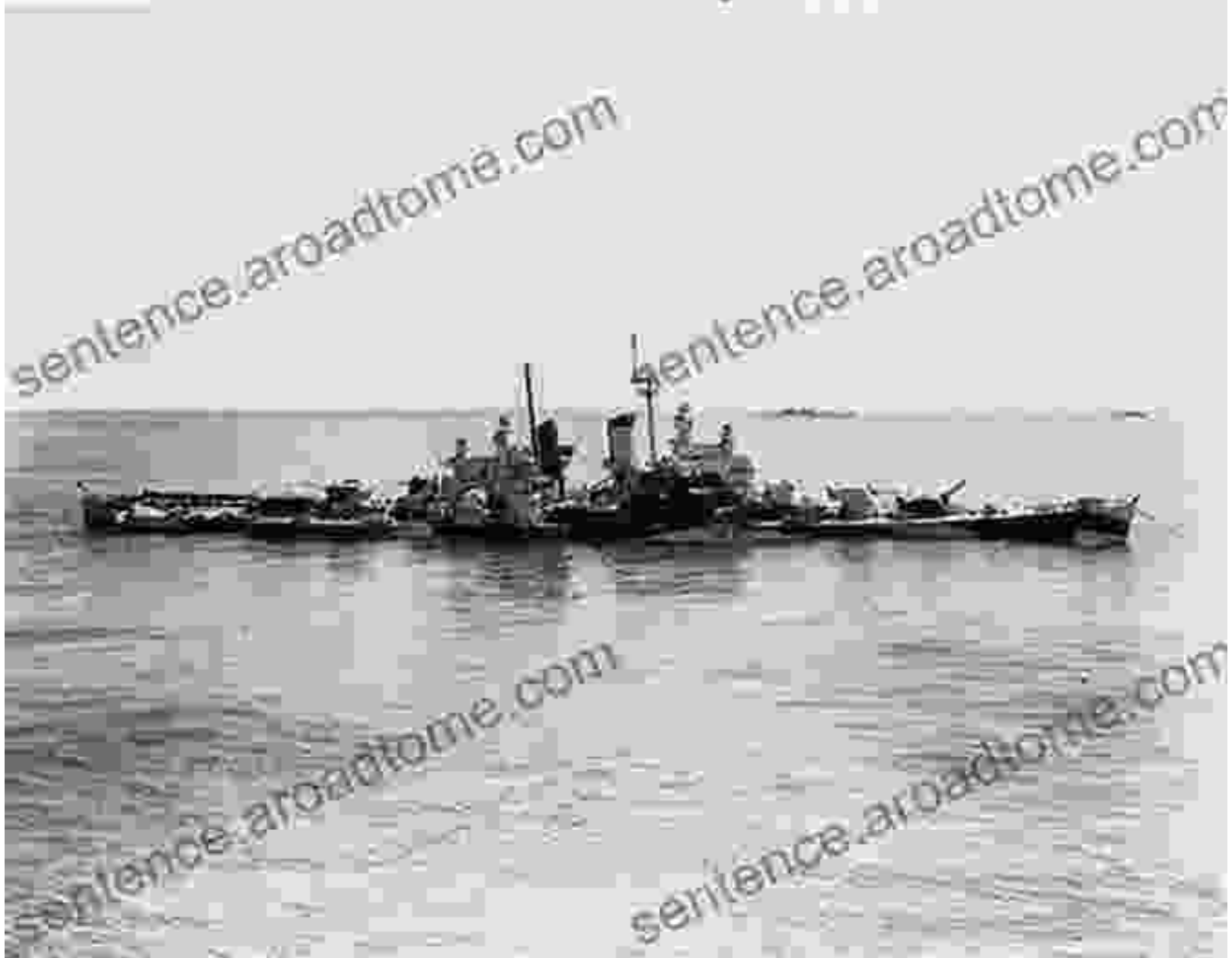
Photo # 80-G-272783 USS Houston under tow after being torpedoed off Formosa, October 1944