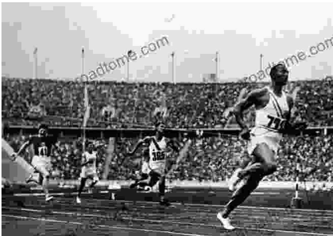
Jesse Owens winning the 100-meter dash at the 1936 Olympics

The early chapters of The Story Of The Men 100 Metre Champions focus on the pioneers of sprinting. Men like Jesse Owens, who won four gold medals at the 1936 Olympics, and Carl Lewis, who won nine gold medals in four Olympic Games. These men were not only great athletes, but also icons of their time. They inspired generations of runners and helped to break down racial barriers in sports.