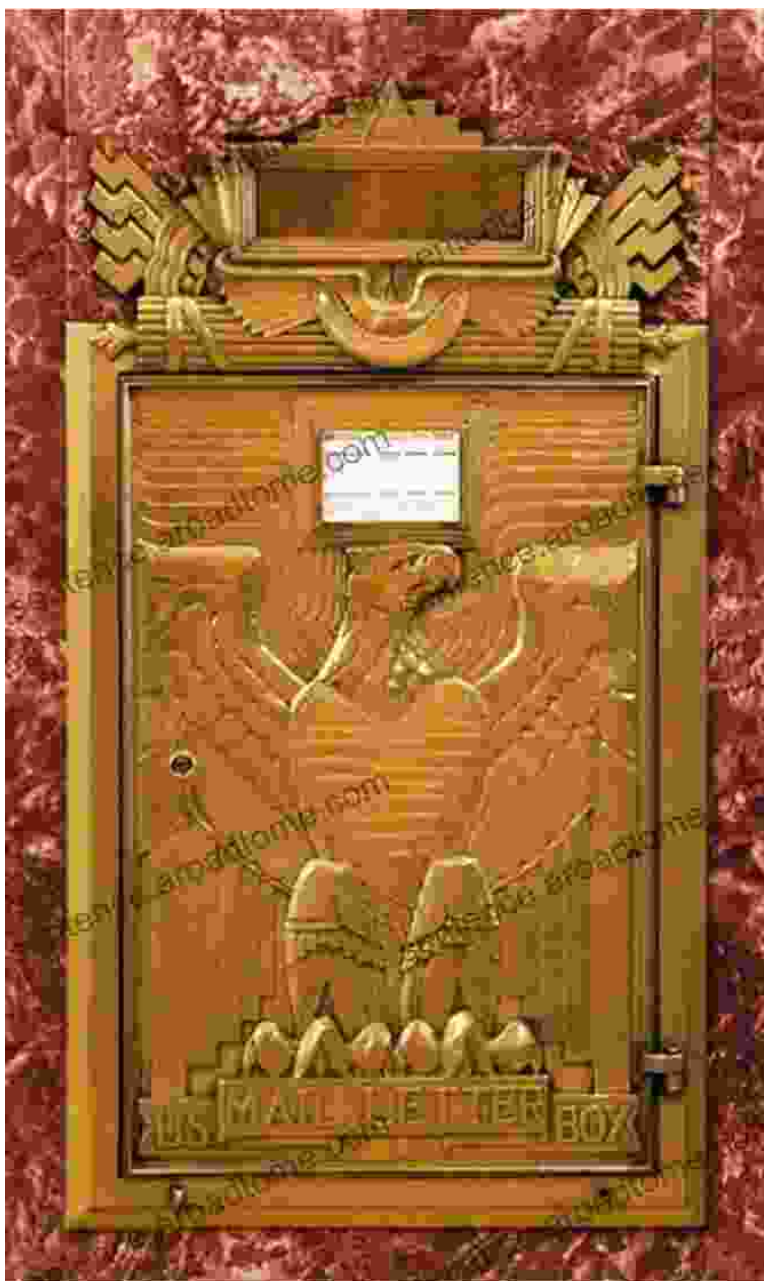
Art Deco mailbox with eagle decoration

Beyond the stunning imagery, our book delves into the rich historical context that shaped the rise of Art Deco mailboxes. We explore the cultural and societal influences that inspired these unique creations, from the post-World War I optimism to the technological advancements of the time.