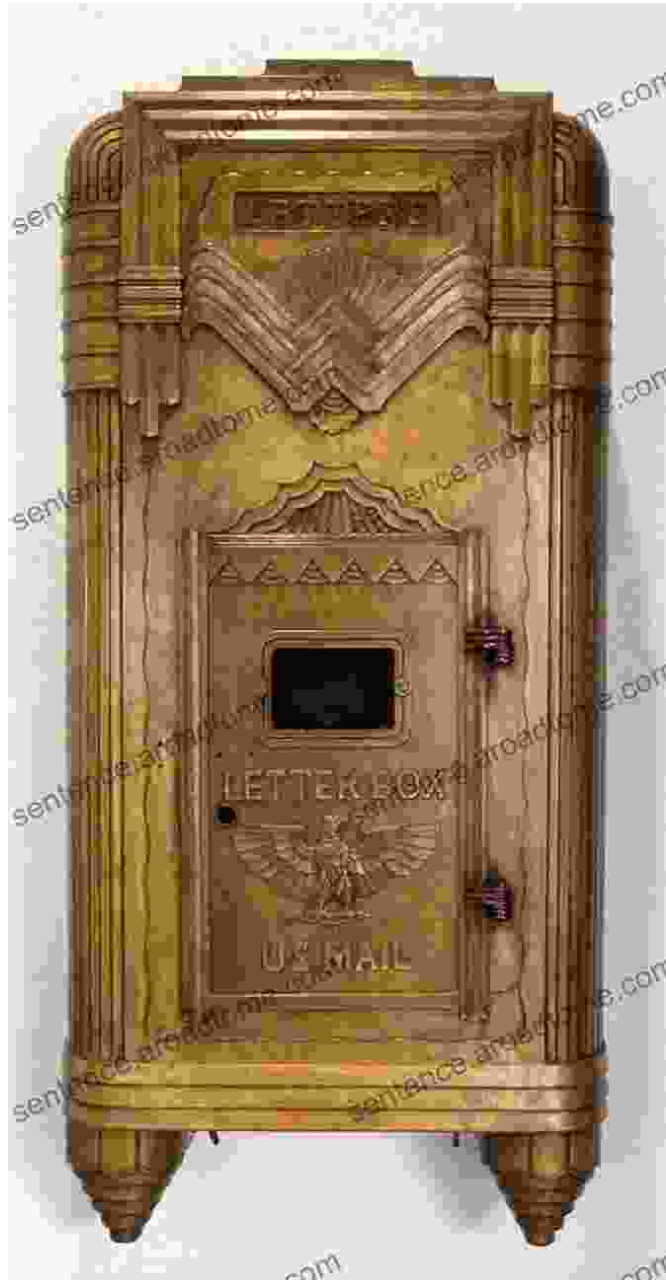
Art Deco mailbox with stepped base

Beyond its historical and collectible significance, this book also serves as a source of inspiration for homeowners looking to add a touch of Art Deco flair to their properties. We explore how to incorporate these unique mailboxes into various architectural styles, from traditional to contemporary.